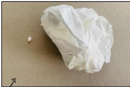
Photo 1: Cut grass. This photographer has hayfever and whilst she loves the smell of cut grass, it makes her sneeze, therefore she has chosen to photograph a tissue and hayfever tablet.